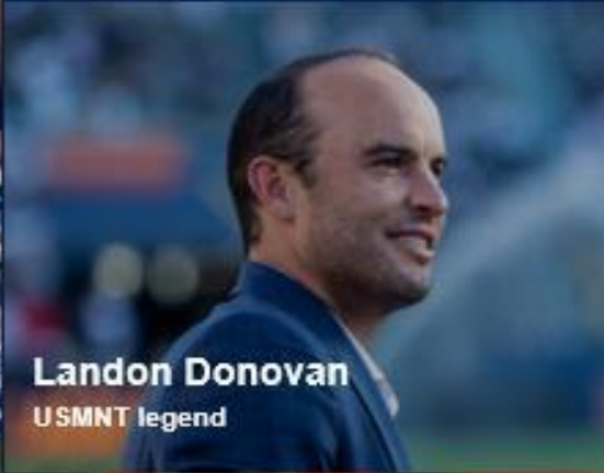
Landon Donovan USMNT legend