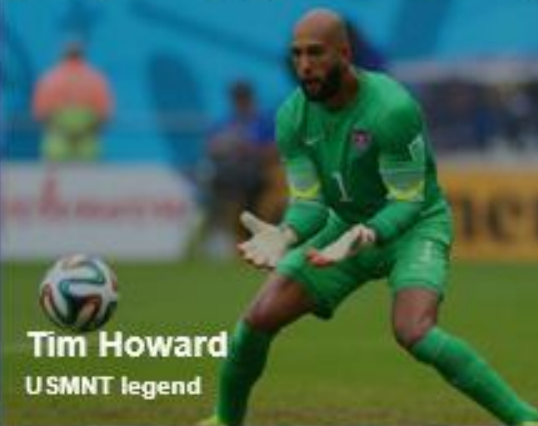
Tim Howard USMNT legend