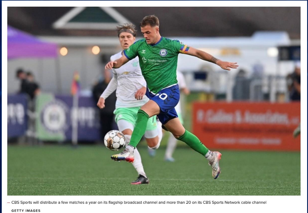
— CBS Sports will distribute a few matches a year on its flagship broadcast channel and more than 20 on its CBS Sports Network cable channel

The deal will run from the 2024-2027 seasons & is the first of two that the USL plans to announce for the 2024 season. The other is believed to be a renewal with ESPN . A source said the USL's media rights revenue between the two deals will be in the mid-to-high seven figures annually.