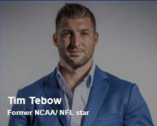
Tim Tebow Former NCAA/ NFL star