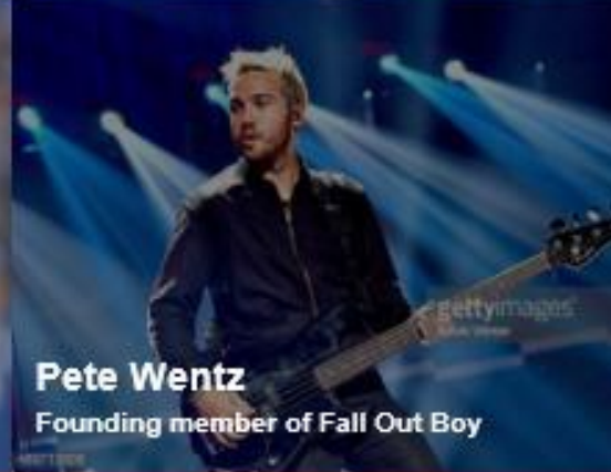
Pete Wentz Founding member of Fall Out Boy