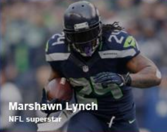
Marshawn Lynch NFL superstar