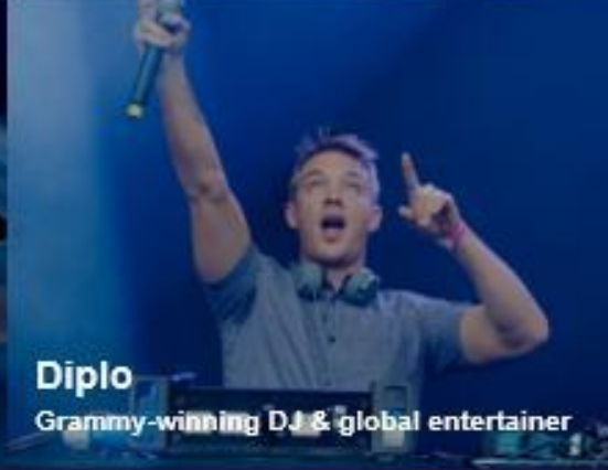
Diplo Grammy-winning DJ & global entertainer