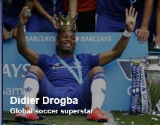
Didier Drogba Global soccer superstar