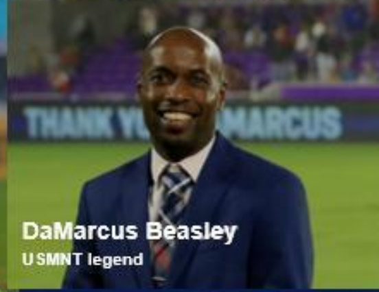
DaMarcus Beasley USMNT legend