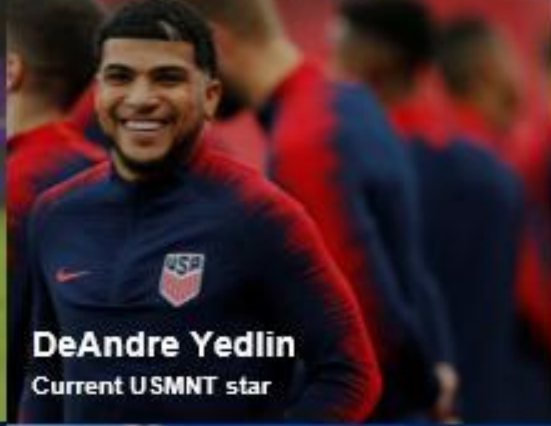
DeAndre Yedlin Current USMNT star